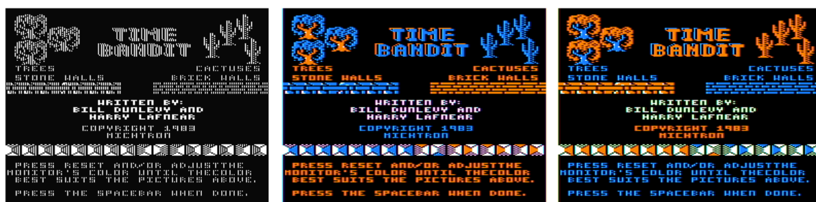
Figure 1.2: Time Bandit , Dunlevy & Lafnear, 1983 in different cross-colour modes

American software was often written to exploit cross-colour artefacts, where alternating patterns of black and white would “trick” the TV into displaying colour. XRoar supports this, and should enable it by default when you choose an NTSC machine. If you’re running an NTSC game on a PAL machine, you can still force XRoar to render the colours by selecting a cross-colour option from View → TV Input. There are also options that affect the fidelity of this rendering. See Section 8.2 [Video output], page 23, for more details.