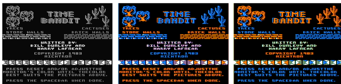
Figure 5.2: Time Bandit , Dunlevy & Lafnear, 1983 in different artefact modes

Try pressing Ctrl+A one or more times. What this really means is that you’re used to running the program on an NTSC machine, and it makes use of cross-colour, but XRoar is emulating a PAL machine. Try starting with -default-machine tano or -default-machine cocous .